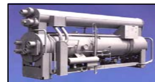
Single-Effect Absorption Chiller