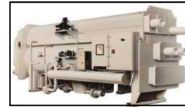
Double-Effect Absorption Water-Cooled Chiller