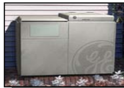
Residential PEM Fuel Cell