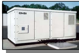
Commercial Phosphoric Acid Fuel Cell